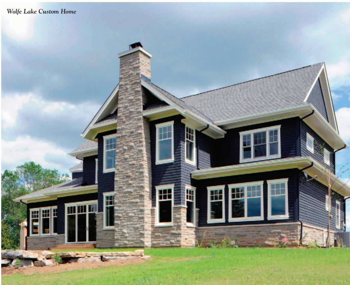
Wolfe Lake Custom Home