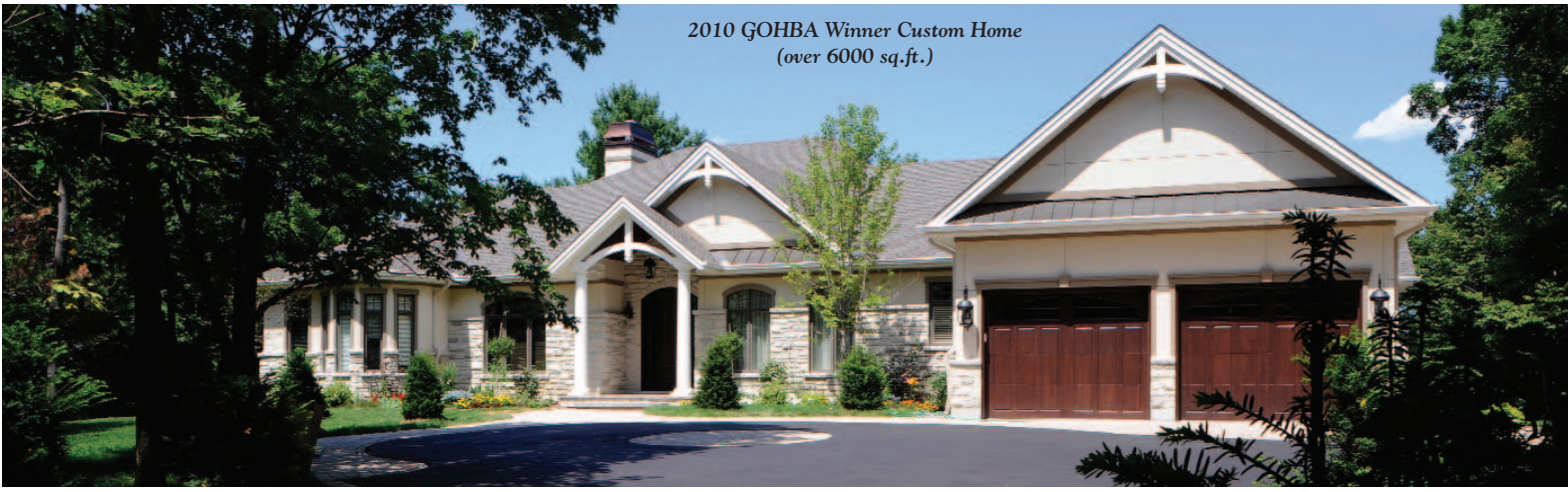
2010 GOHBA Winner Custom Home (over 6000 sq.ft.)